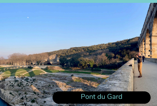
Pont du Gard

Visit the beautiful Maguelone Cathedral, located on a narrow strip of land between sea and lagoon. Here you can lunch, while supporting a local social reintegration initiative. Continue toward wild and protected Mediterranean beaches where you can relax, swim, and observe local birdlife, including flamingos.