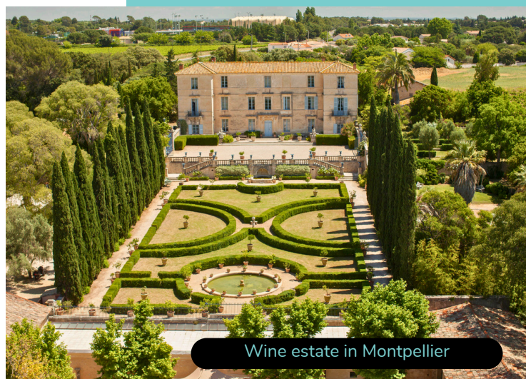
Wine estate in Montpellier