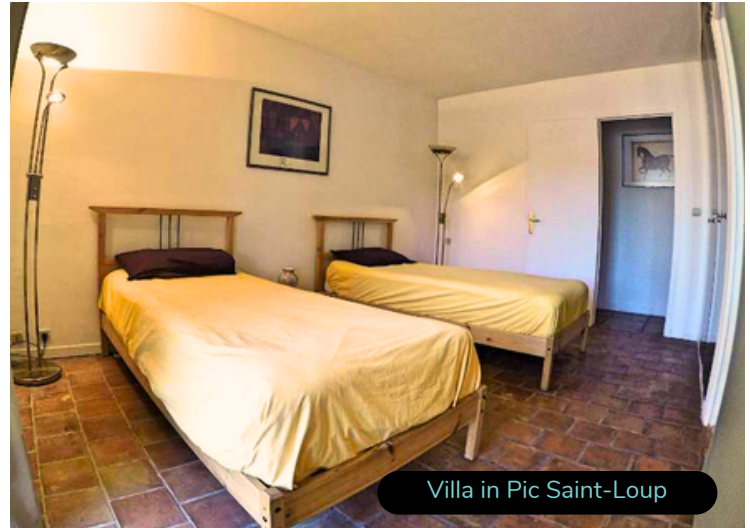
Villa in Pic Saint-Loup