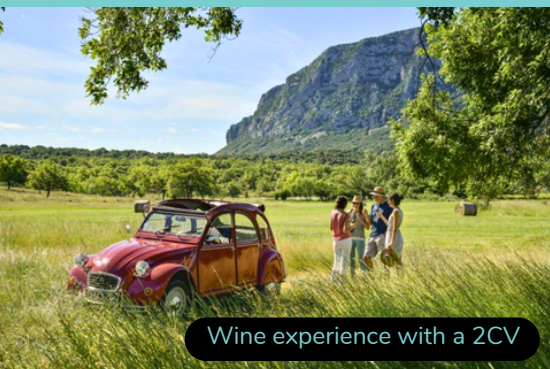
Wine experience with a 2CV