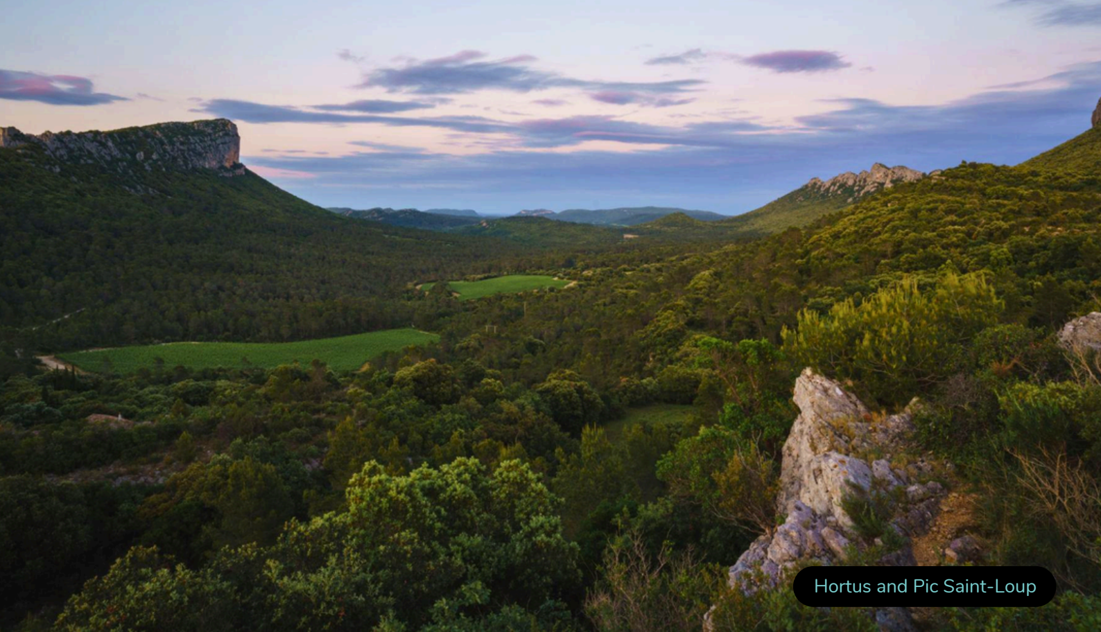
Hortus and Pic Saint-Loup