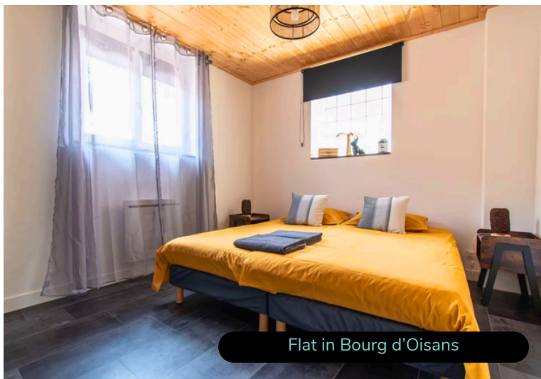
Flat in Bourg d'Oisans