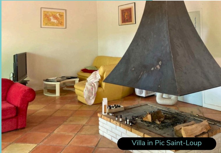
Villa in Pic Saint-Loup