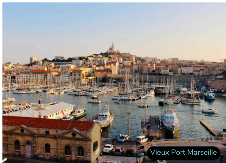
Vieux Port Marseille