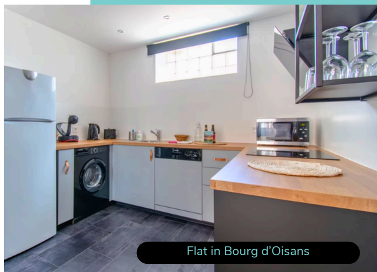
Flat in Bourg d'Oisans