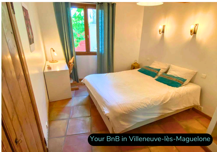
Your BnB in Villeneuve-lès-Maguelone