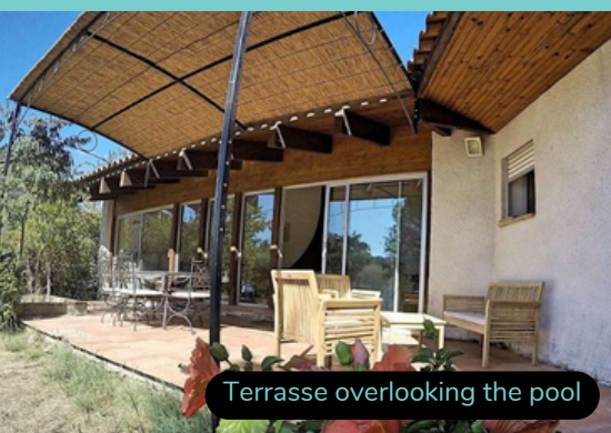
Terrasse overlooking the pool