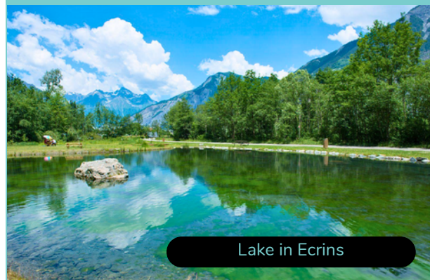
Lake in Ecrins