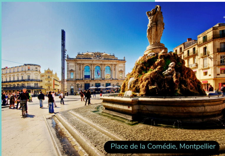
Place de la Comédie, Montpellier