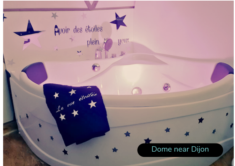
Dome near Dijon