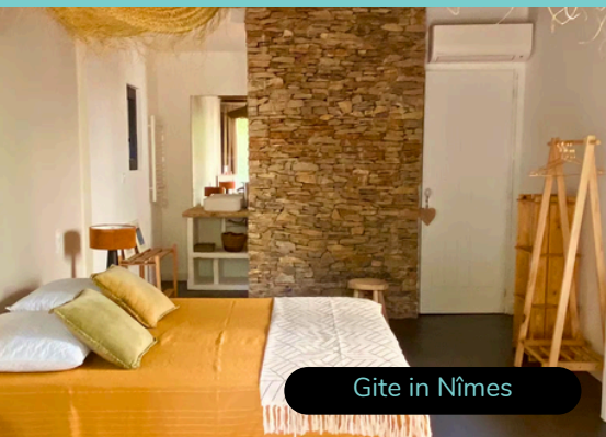
Gite in Nîmes