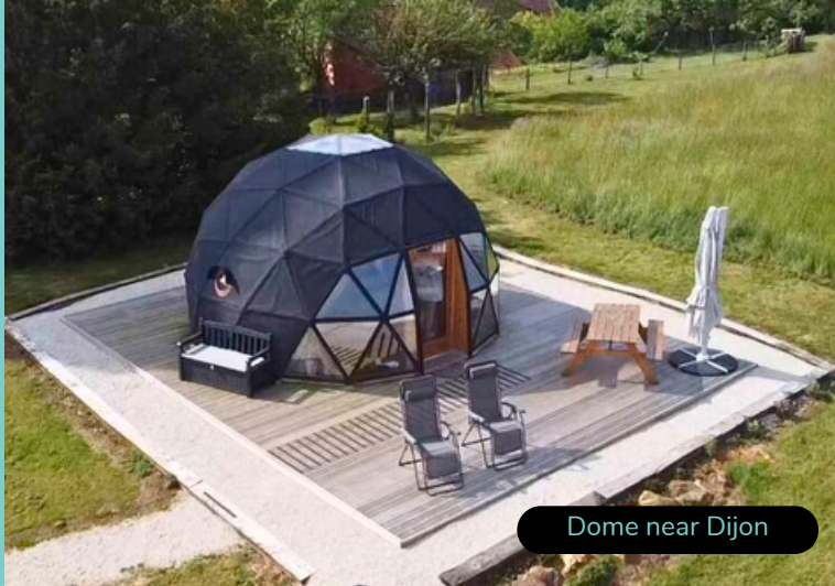
Dome near Dijon