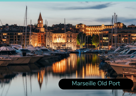
Marseille Old Port