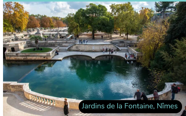
Jardins de la Fontaine, Nîmes