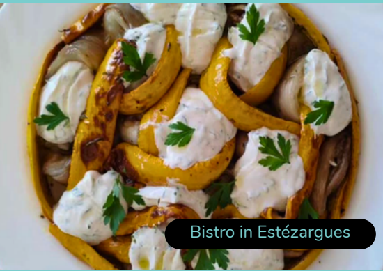
Bistro in Estézargues