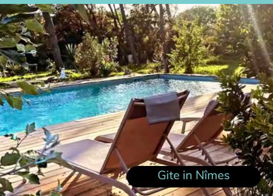
Gite in Nîmes