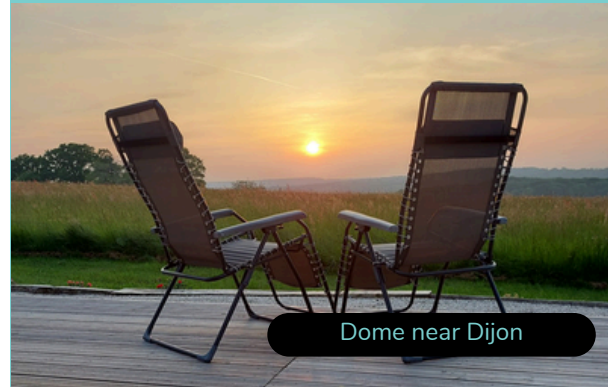
Dome near Dijon