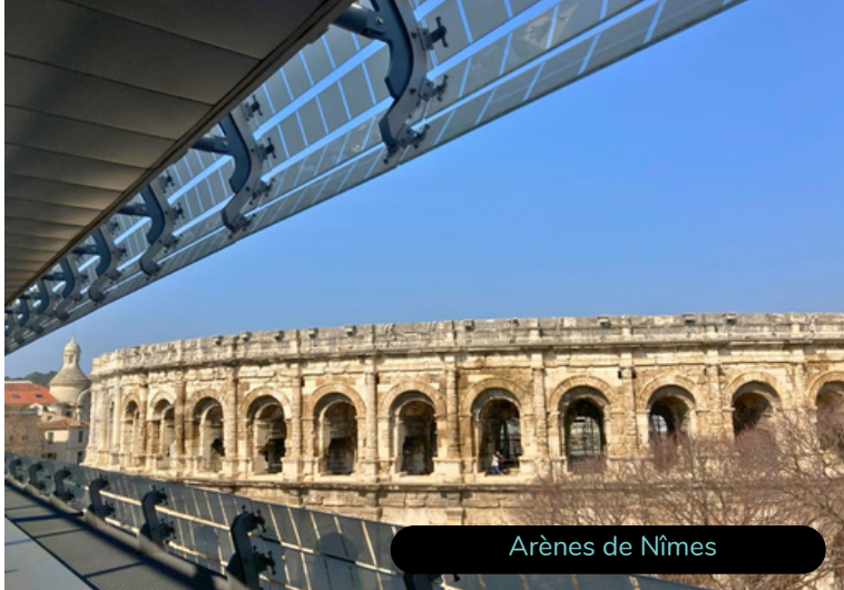
Arènes de Nîmes