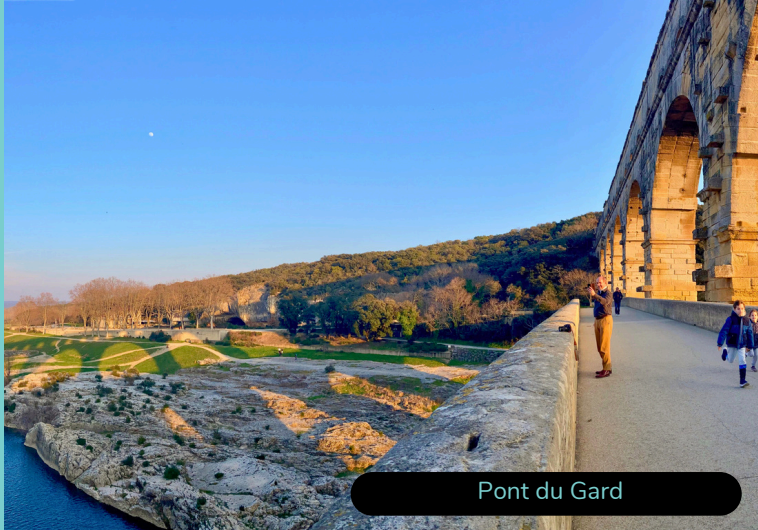
Pont du Gard