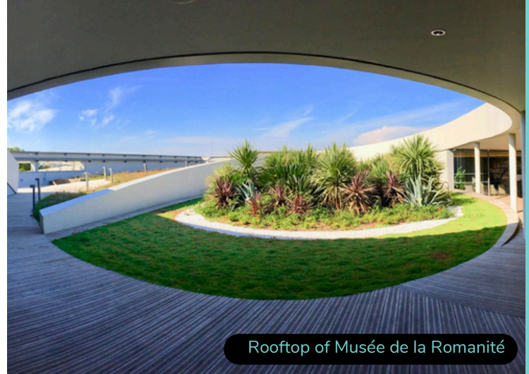
Rooftop of Musée de la Romanité