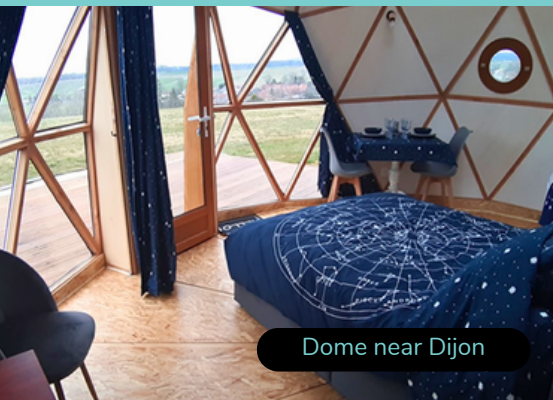
Dome near Dijon

Settle in and enjoy your first evening in the South.