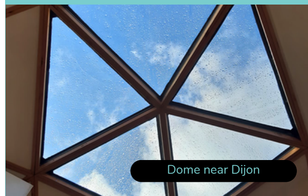
Dome near Dijon