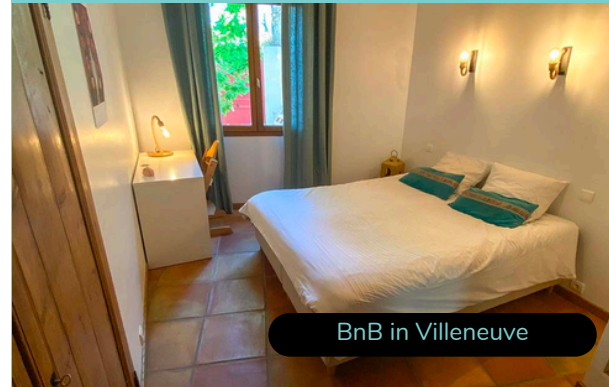
BnB in Villeneuve