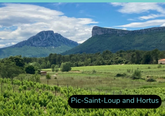
Pic-Saint-Loup and Hortus