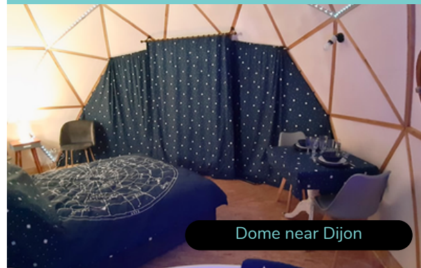
Dome near Dijon