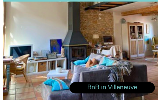
BnB in Villeneuve