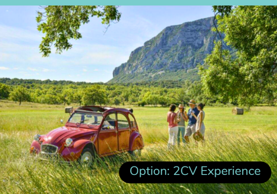
Option: 2CV Experience