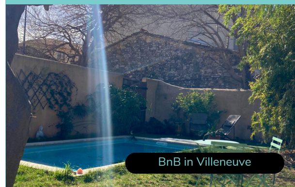
BnB in Villeneuve