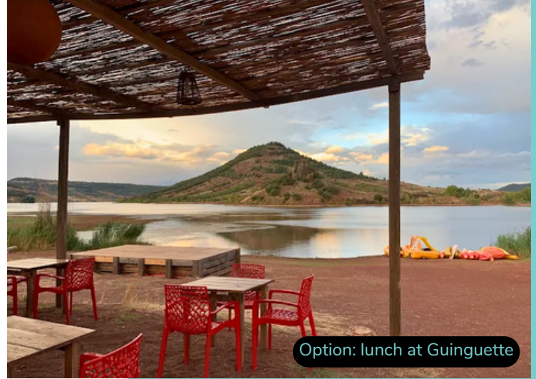
Option: lunch at Guinguette