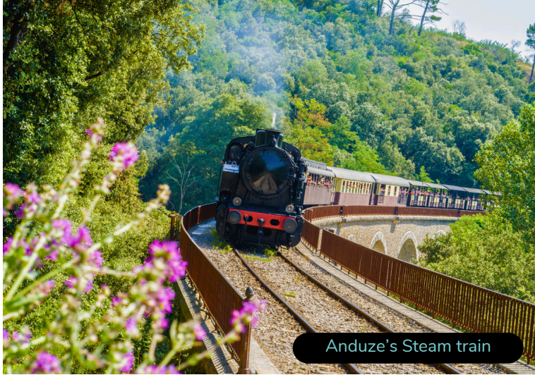
Anduze's Steam train