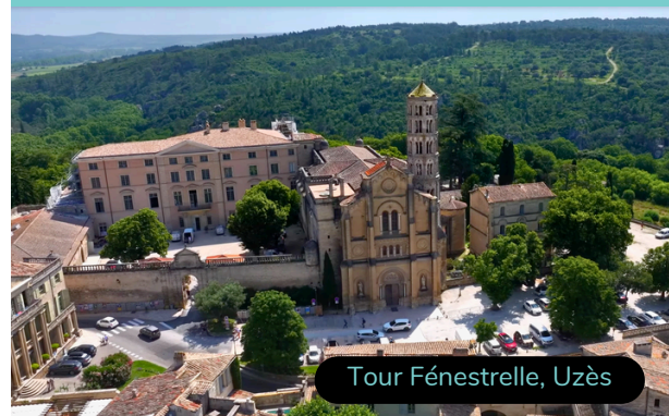
Tour Fénestrelle, Uzès